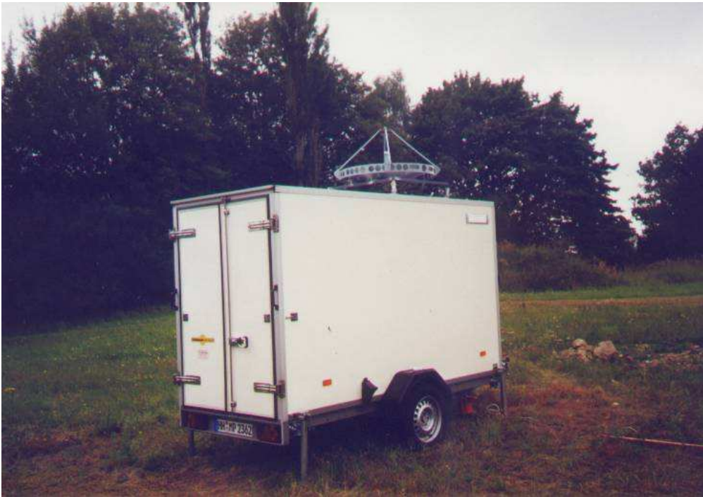
First system, delivered to MPI-MET in 2001