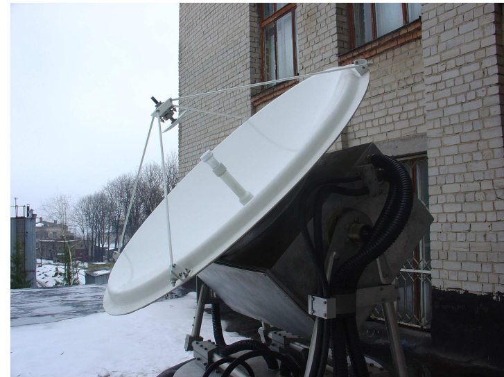
System No. 4 to be delivered to IMK in 2005